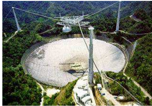
Fig. 2: The big radio telescope at Arecibo, a reference point for many SETI searches.

The search for extraterrestrial radio signals of artificial nature involves a detailed assessment of the following issues: